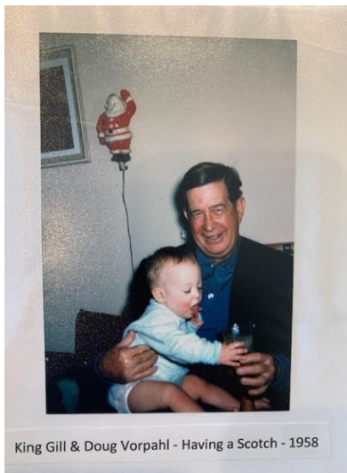
King Gill & Doug Vorpahl - Having a Scotch - 1958