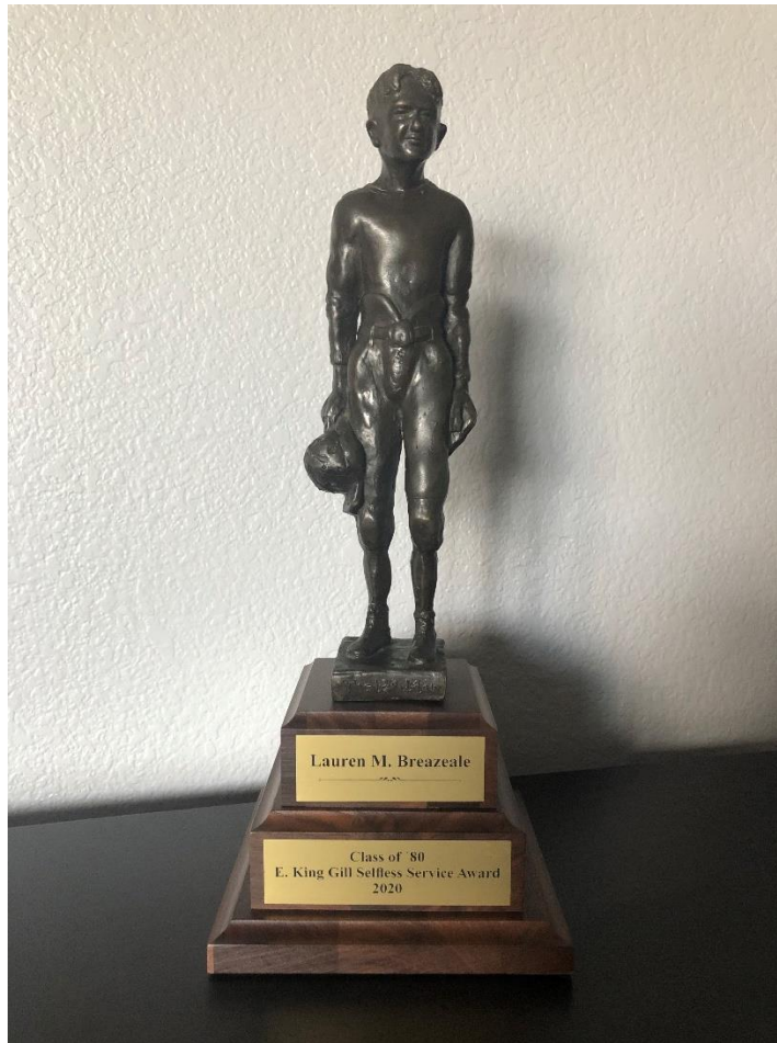
Current plaque sample for each recipient going forward beginning with 2 nd Recipient